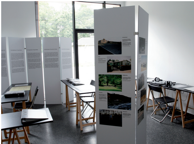
View of the exhibition shown at the Ravensbrück Memorial, August 2012.