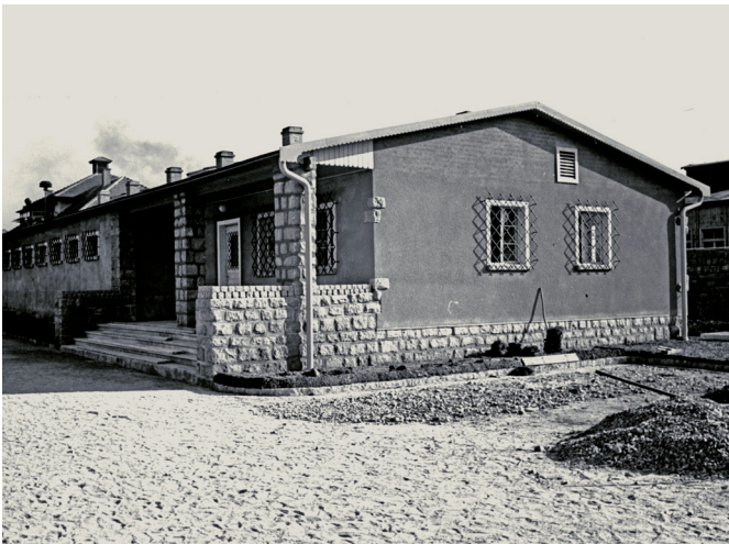
Brothel barrack of the Gusen concentration camp.

The existence of brothels in certain concentration camps has long been the subject of specific historical discussions. In 1942 the head of the SS, Reichsführer Heinrich Himmler, issued an order calling for the establishment of brothels inside concentration camps. The camp brothels were intended to motivate male prisoners to work harder, and the system was ultimately expanded to include ten camps. The building of 'Sonderbauten' (special constructions) – as the SS referred to them – became part of a bonus system introduced across the camps in 1943. Over 200 female prisoners were sexually exploited in these camp brothels. Most of them had originally been inmates of the Ravensbrück women's concentration camp.